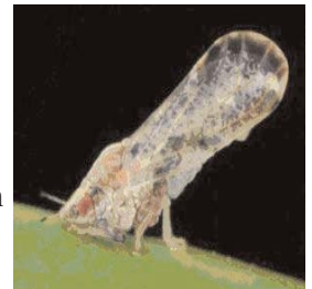
Have you seen this really tiny bug?

The Asian citrus psyllid (pronounced SIL-lid) looks like a small, brown grain of rice—and it can carry a deadly bacterial disease that is harmless to humans but inevitably fatal to all varieties of citrus. It has been found in San Diego, Imperial, Orange and Los Angeles counties. It is expected to reach Ventura County this year. There is no treatment or cure for the disease carried by the psyllid; it has already destroyed millions of trees in citrus-producing regions around the world, including Florida.