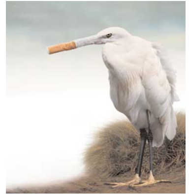
Non-Native Species of the California Coast.

Thank you for doing your part to keep our community and its watershed clean. For more information on pollution prevention, please visit www.cleanwatershed.org or call the City of Camarillo at (805) 383-5659.